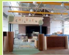
(L-R: Help desk, periodicals room, children's area)