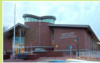
(L-R: North side, rain chain/granite sculpture, front plaza)